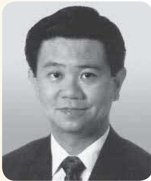
Mr Wong Kan Seng Minister For Home Affairs